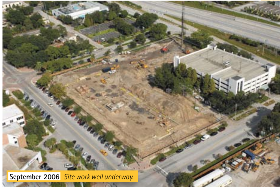
September 2006 Site work well underway.

Optimal Outcomes, LLC capitalizes on a broad variety of functional specialties that offers clients an integrated one-stop shop for successful healthcare developments. These capabilities include, but are not limited to, feasibility assessments, site selection and acquisition, facility design, project management, construction oversight