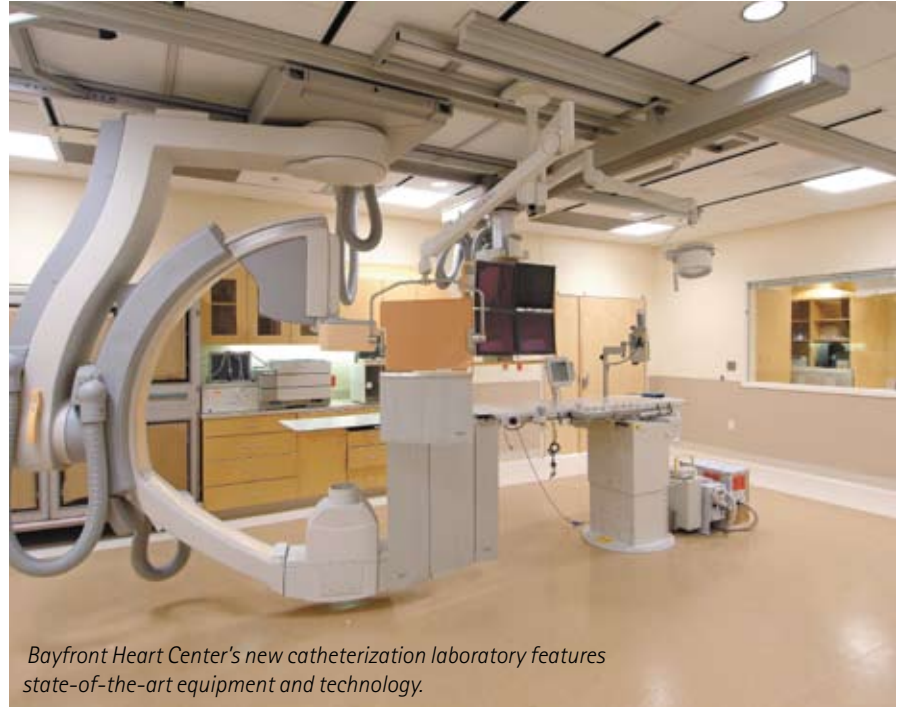
Bayfront Heart Center's new catheterization laboratory features state-of-the-art equipment and technology.

Moving forward to 2009, Bayfront Baby Place will relocate to the new All Children's Hospital. Bayfront will lease the third floor of the children's hospital to house our comprehensive obstetrics program staffed by Bayfront physicians and nurses. This unique set-up will enable mothers to be close to their babies, no matter