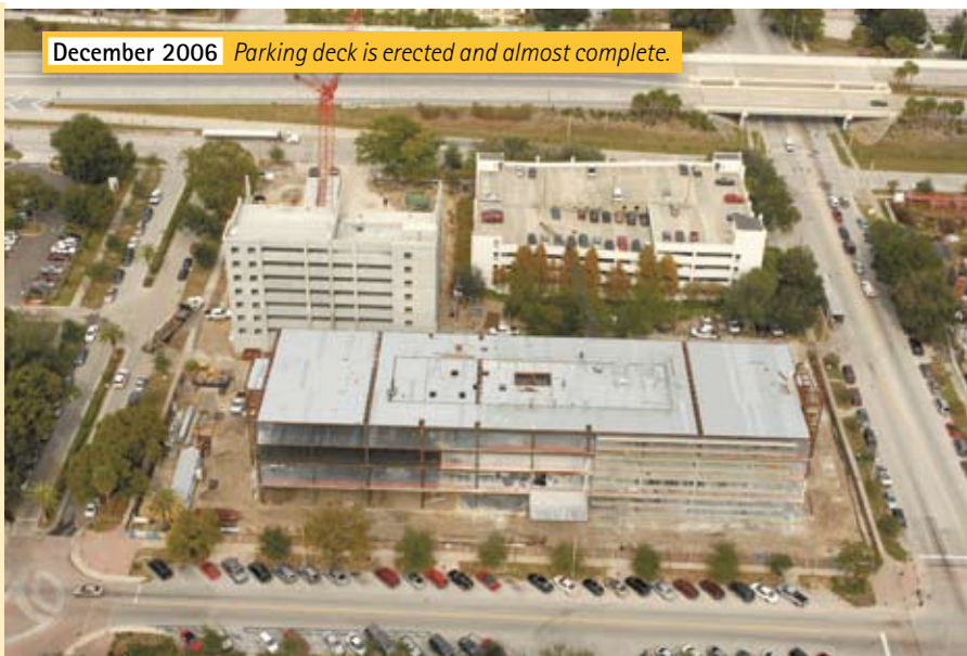
December 2006 Parking deck is erected and almost complete.

"I am elated to be in the new building. The Optimal team worked diligently to understand the needs of my practice and the result speaks for itself. Patients and staff are pleased with the new space and, most importantly, the way it functions. The end product is quality that helps to improve patient care and operational efficiency. Optimal Outcomes really added value."