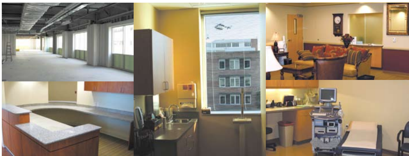
Design flexibility allows for a variety of interior configurations and customization options. (top left) Empty, with ductwork in place. (bottom left) Reception area. (middle) Intake room; Bayflight in flight in the distance. (top right) Patient waiting room. (bottom right) Sonogram/exam room.