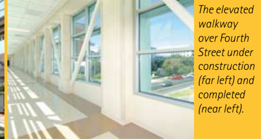
The elevated walkway over Fourth Street under construction (far left) and completed (near left).

services etc.). Each of these items entails an economic impact that will either make the facility development worthwhile or not.