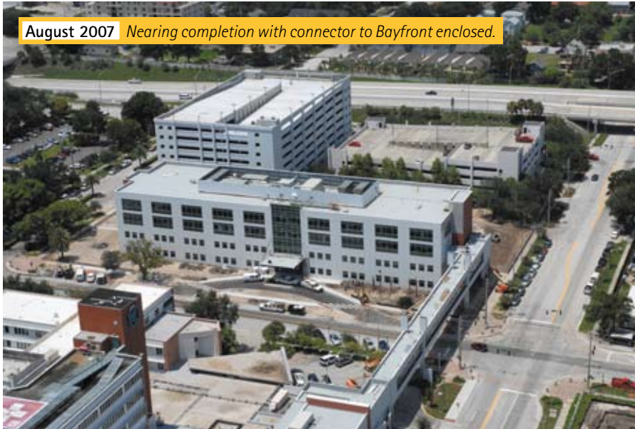
August 2007 Nearing completion with connector to Bayfront enclosed.