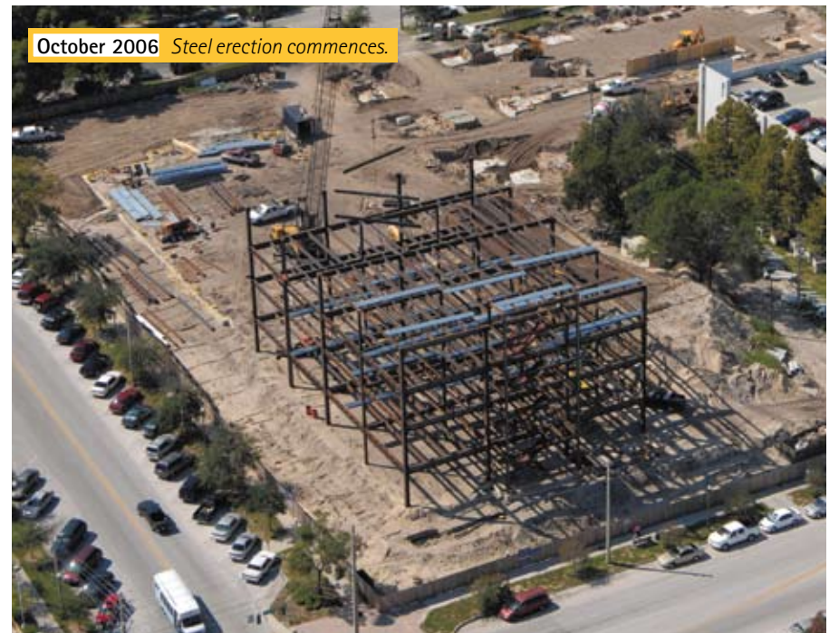
October 2006 Steel erection commences.

"Exclusive of extenuating circumstances, if a new healthcare facility cannot add value to the core businesses of its occupants then don't build it," says Andrew Boggini. Invariably rent (or the implicit carrying cost) of new space will be greater than old space. The challenge therefore comes from educating clients on how to assess the economic realities and implications of a new facility.