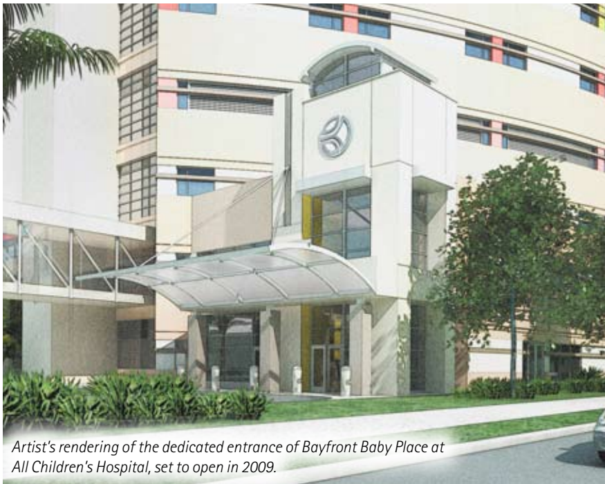
Artist's rendering of the dedicated entrance of Bayfront Baby Place at All Children's Hospital, set to open in 2009.

rooms; and suites for ECHO, EKG and transesophageal echocardiography.